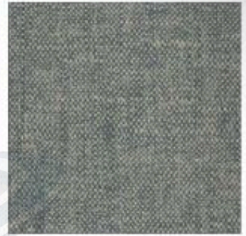
VANI 115221 Shadow