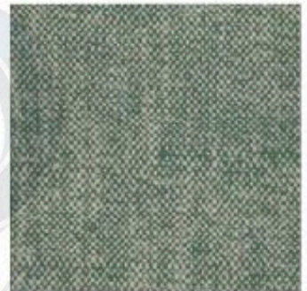
VANI 115225 Juniper