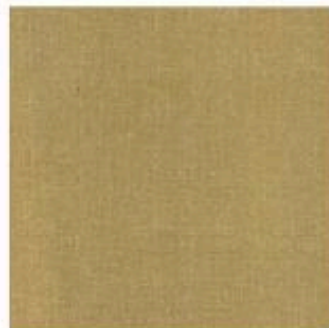
VANI 115208 Dison