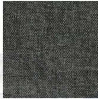
VANI 115234 Charcoal