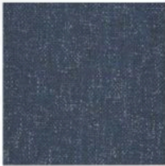
VANI 115232 Indigo