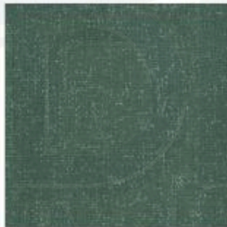
VANI 115224 Emerald