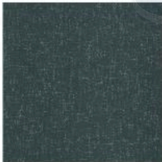
VANI 115223 Serpentine