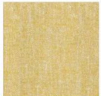
VANI 115209 Saffron