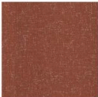
VANI 115204 Cochineal