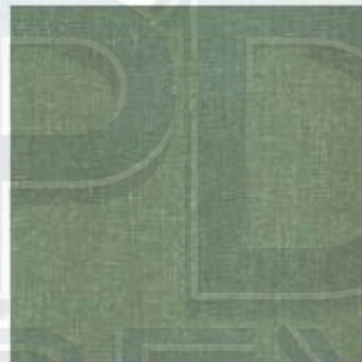
VANI 115226 Eucalyptus