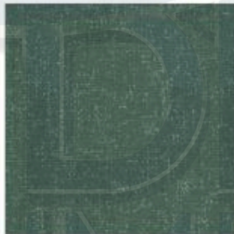
VANI 115224 Emerald