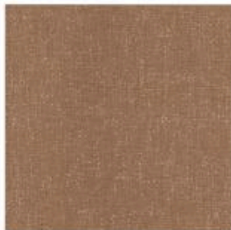
VANI 115202 Madder