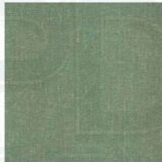
VANI 115226 Eucalyptus