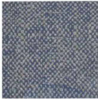
VANI 115231 Denim